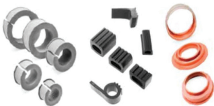
Insulation bushes / Sealing profiles / Bellows and HVAC ducts